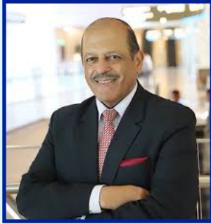
Amb Sujan Chinoy DG, IDSA