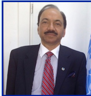
AB Mathur Former Spl Sec, Govt of India